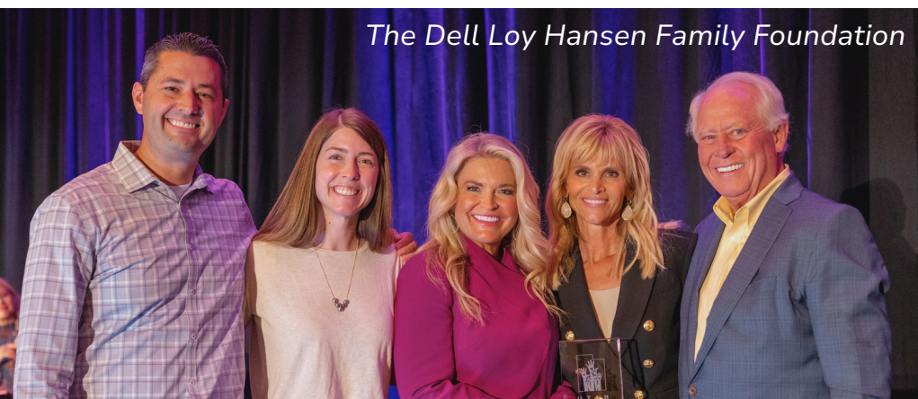
The Dell Loy Hansen Family Foundation